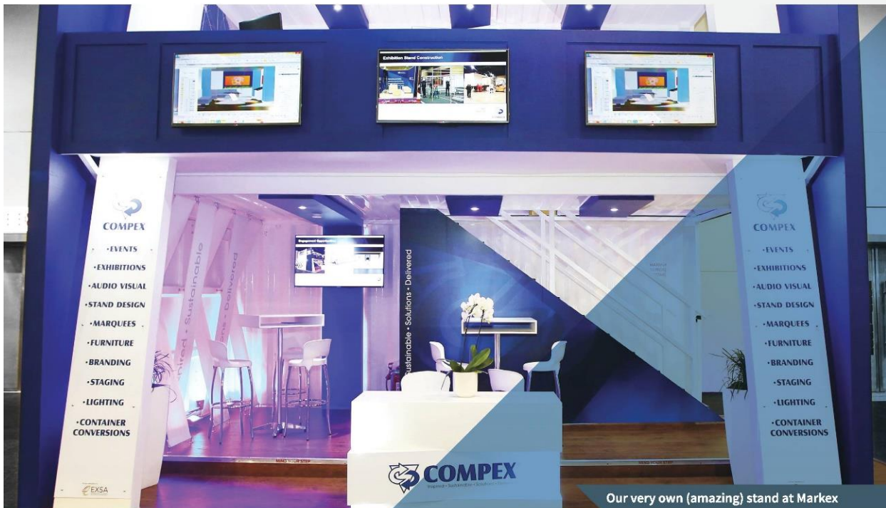
Our very own (amazing) stand at Markex

So you've booked your (boring) standard shell scheme exhibition package and have made a note to buy extra Prestik on your way home for the posters you intend to stick on your stand's walls... Don't worry, we won't judge you for taking this approach.